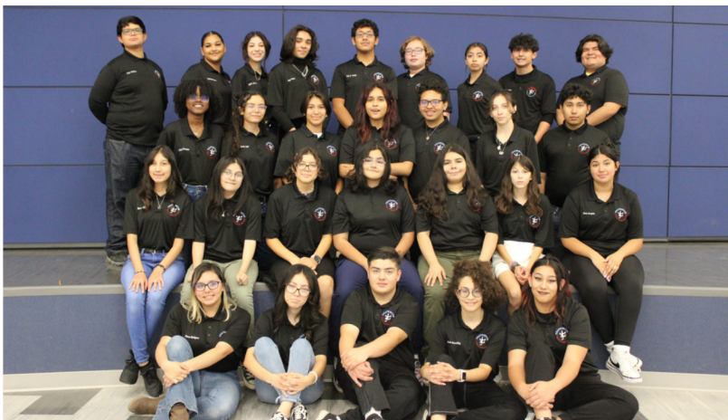
2022 - 2023 Teatristas