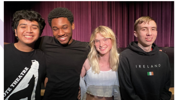
2022 - 2023 Officers: