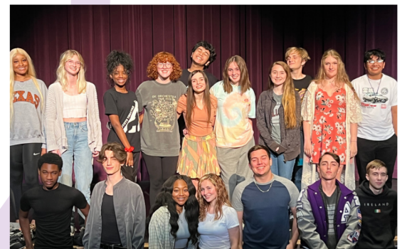
2022 - 2023 Production Class